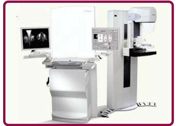
Hologic Selenia with CAD

Announcing our new Hologic Selenia mammogram with CAD (Computer-Aided Detection). Our new mammogram will be able to identify regions of interest and bring them to the attention of the radiologist, helping to decrease false negative readings. The Hologic Selenia features a selenium based direct capture technology that eliminates light diffusion completely, providing perfect clarity and exquisite image quality. Our Hologic Selenia mammogram can help detect cancer up to 2 years before it can be found by a physical examination. This amazing machine will be available in our new Palmdale facility mid July