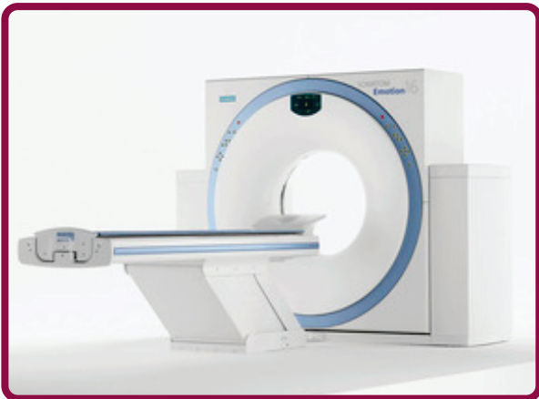
Siemens Biograph 40 Slice PET-CT

Presenting our new Siemens Biograph 40 slice PET-CT, which is yet another first to the Antelope Valley, and is the only one of its kind within a 100 mile radius. Our 40 slice PET-CT is capable of performing a Coronary CTA. The Biograph is also capable of performing two scans at once time which decreases the scan time. Patients will appreciate the faster scan times, and doctors will be amazed at the high quality of the 2D and 3D images it produces.